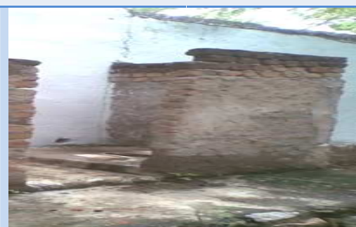
Gram Panchayat: Thummalacheruvu Mandal: Ghattu District: Mahbubnagar IHHL without door, roof and devoid of water