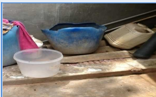
Gram Panchayat: Banda Raviryala Mandal: Hayath Nagar District: Rangareddy Toilet used as store room